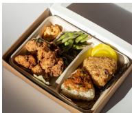
$20-$18 (Depends on quantity)