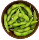
Edamame (vegan) $4