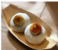
Banana Foster Mochi $4