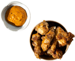
Chicken Karaage (Japanese Crispy Chicken) $4