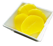
Takuan pickles (vegan) $1