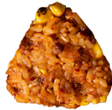
Crunchy garlic corn (vegan) $4