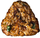
Pork Bell $4