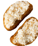
Inari (tofu pockets) (vegan) $4