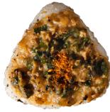
Negi Miso (vegan) $4