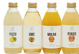
Kimino drinks $4