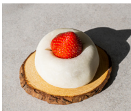
Strawberry Mochi $4